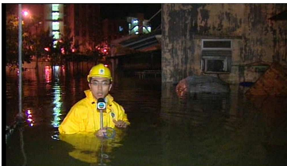
Figure 2. Sea flooding at Tai O during the passage of Typhoon Hagupit on 23-24 September 2008.

On 23 September 2008, Typhoon Hagupit, the strongest tropical cyclone that affected Hong Kong in 2008 passed about 180 kilometres south-southwest of Hong Kong and necessitated the issuance of the number 8 gales or storm force winds signal in Hong Kong. It brought about a storm surge of 1.4 metres at the Victoria Harbour, raising the sea level to a height of 3.53 metres above Chart Datum (CD) a few hours before high tide. This is the second highest sea level recorded at the Victoria Harbour since the Second World War, after the record high of 3.96 metres during the passage of Typhoon Wanda in 1962. The raised sea level caused sea flooding in many low-lying places, including Tai O, Peng Chau, Tuen Mun, Sham Tseng, Sai Kung, Yau Tong, Lei Yue Mun and Chai Wan. The flooding in Tai O, which cut off electricity supply and affected more than 200 households there, was reported to be one of the most serious events in the past several decades (Hong Kong Observatory, 2008).