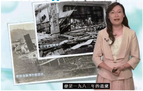
Outstanding Creativity Award: Sea Level Rise Imminent!