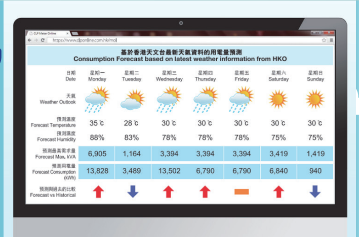
The "7-day Energy Forecast" feature of CLP's "Meter Online Service".

To increase public awareness of climate change and enhance measures to conserve energy, CLP Power Hong Kong Limited (CLP) and the Hong Kong Observatory have teamed up to launch the "7-day Energy Forecast" based on the HKO's 7-day weather forecast. A new feature of CLP's "Meter Online Service", the energy forecast helps property managers plan energy saving measures in order to reduce electricity consumption in periods of hot weather. The "7-day Energy Forecast" initiative has delivered remarkable results, proving that technology and partnership can successfully drive behavioural changes and turn awareness into action to combat climate change.