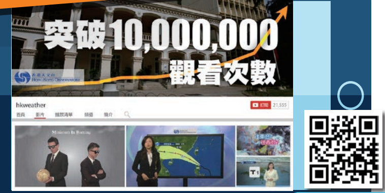
The Observatory's YouTube video channel

Since the channel's launch in 2009, the Observatory's short videos have been very popular. After the introduction of three viewing options – "Weather On-Air", "Cool Met Stuff" and "Central Weather Briefing" at the end of 2013, both the quantity and quality of the videos have been greatly improved to meet the public demand of more meteorological knowledge and weather information.