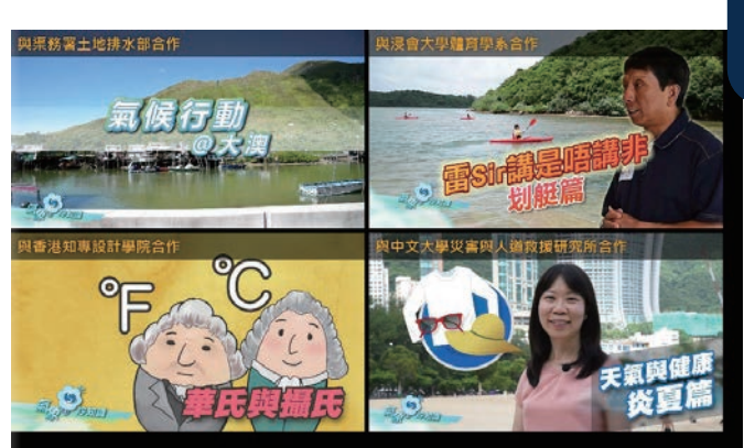
"Cool Met Stuff" is the result of collaborative efforts

During the summer, the cumulative views of Observatory's YouTube video collection surpassed 10 million (11,846,433 as at the end of September 2016)! The increase in the past couple of years was particularly significant, rising by several folds to nearly 7.6 million and accounting for more than 60% of the total views.