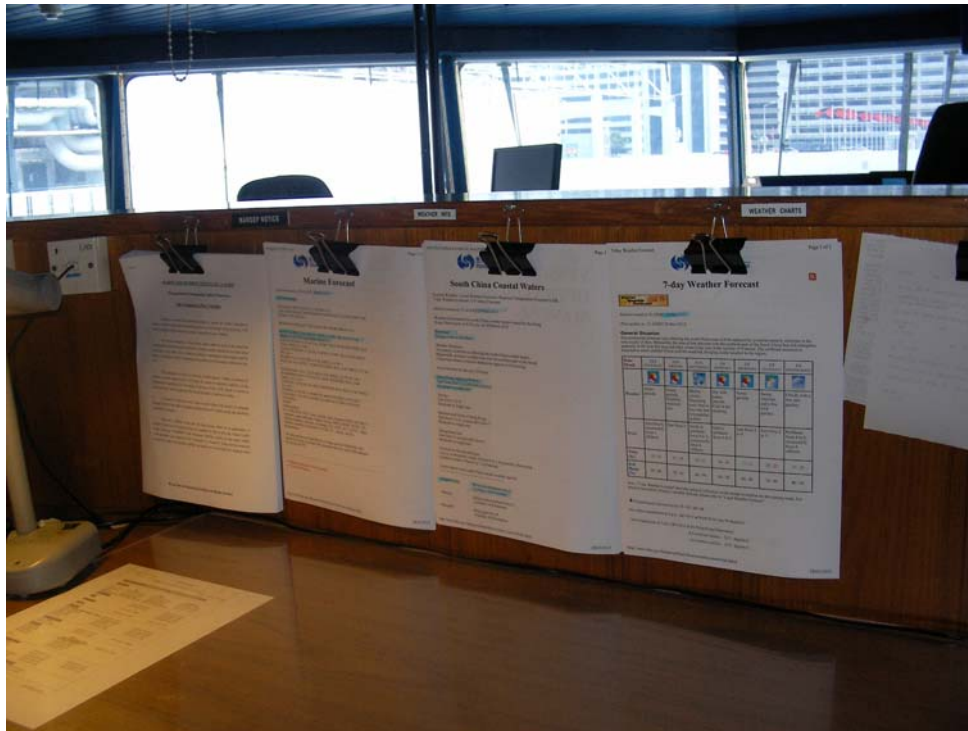
Meteorological messages received via internet in a Hong Kong Voluntary Observing Ship