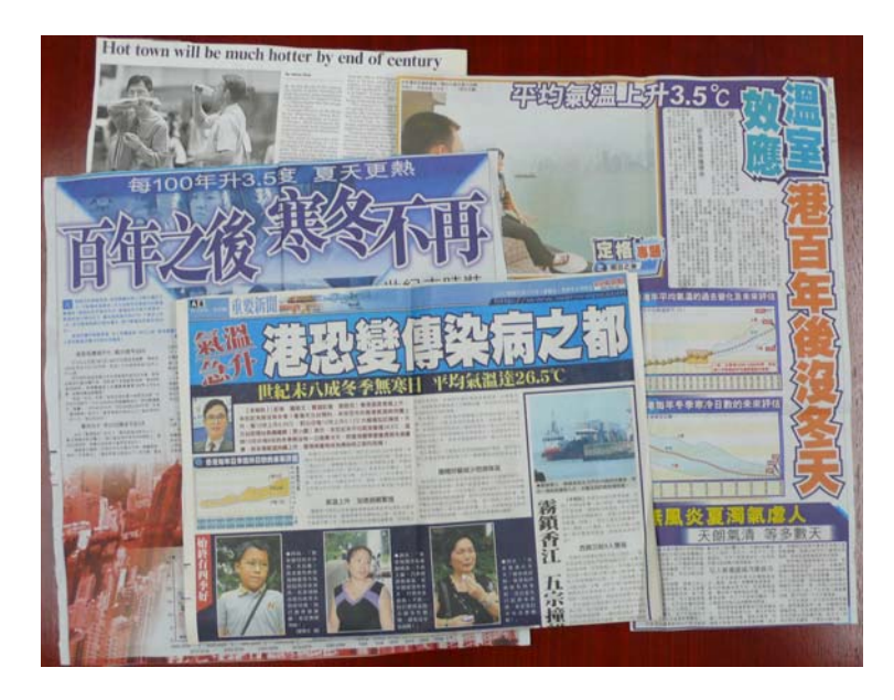
Fig. 3 Press cuttings on the "absence of winter" at the end of the 21<sup>st</sup> century