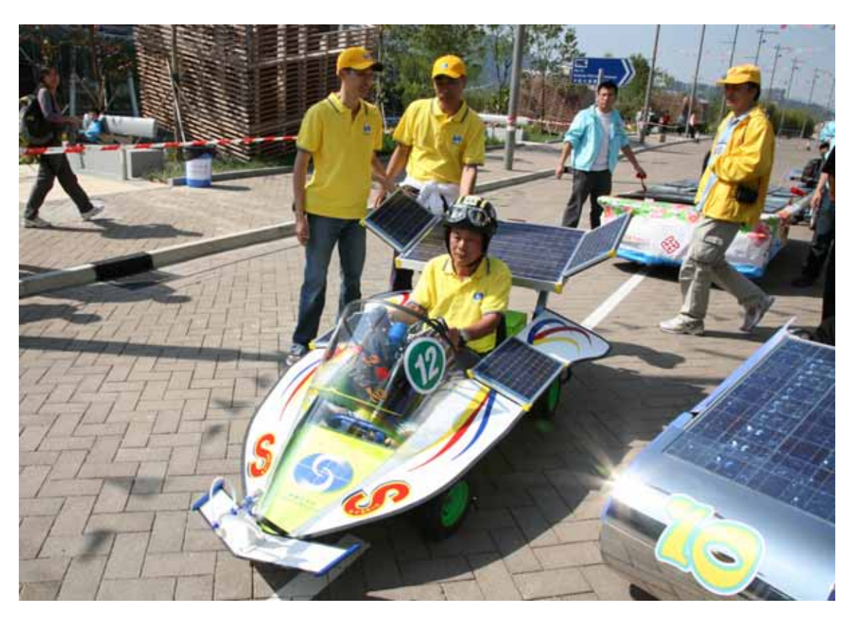
Figure 3 The Hong Kong Observatory participated in the Solar Cart Race organized by the Friends of the Earth.