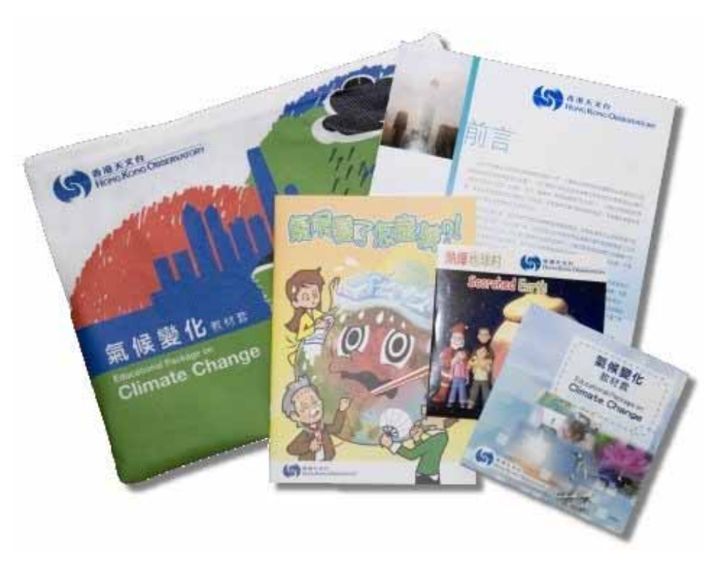
Figure 5 The educational package on climate change produced by the Hong Kong Observatory