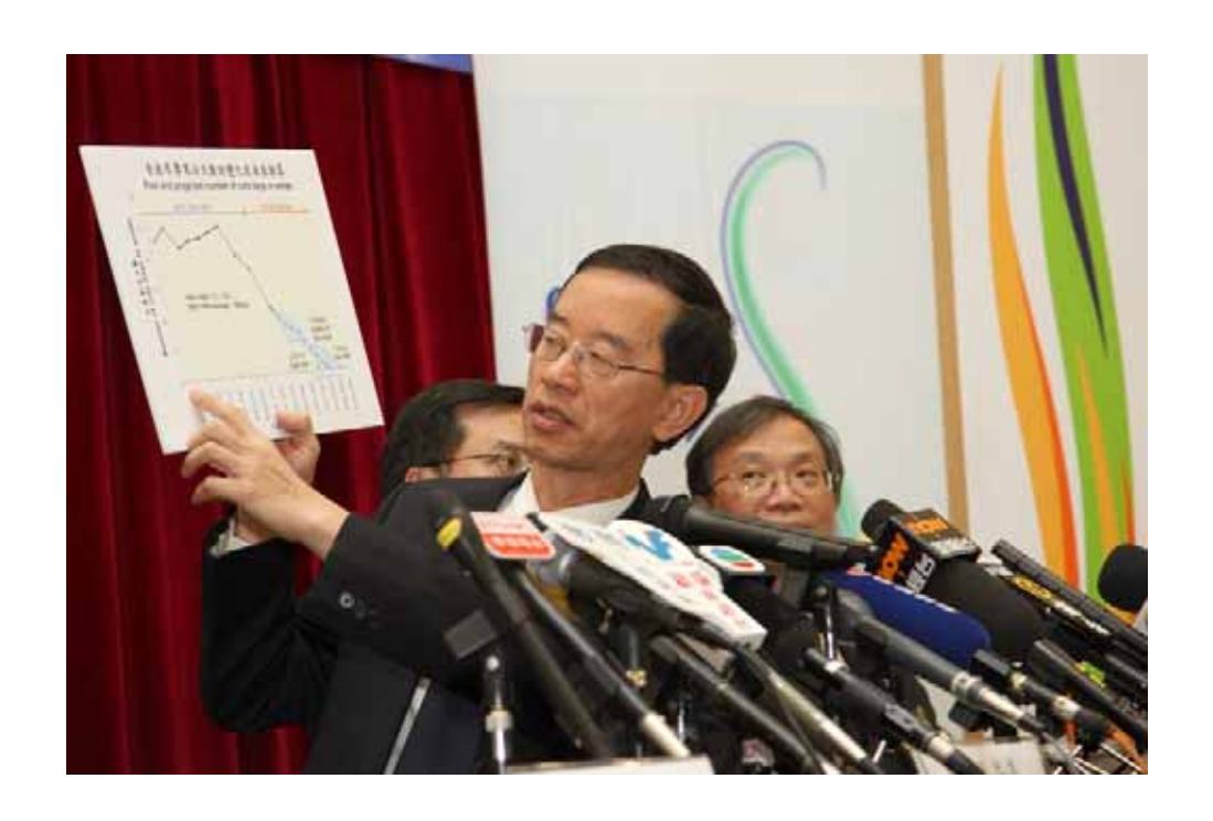
Figure 1 The Director of Hong Kong Observatory, Mr. Lam Chiu-ying, announced the updated projection for the temperature trend in Hong Kong in the 21st century at the Observatory's annual media briefing on 12 March 2008.