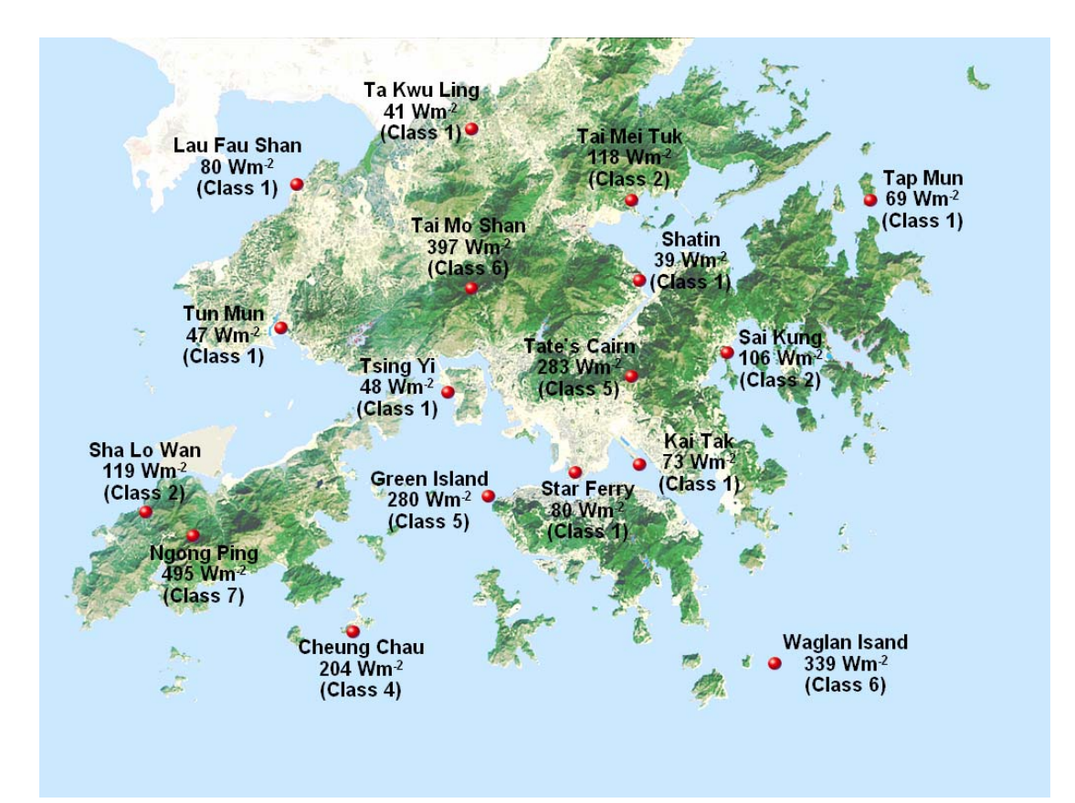
Figure 1. Distribution of mean wind power density in Hong Kong (Wind power class in brackets).